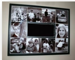
Photo on left is with 8 photos (four -6" and two -6x8 tiles) Photo below is with 10 photos (6" tiles)